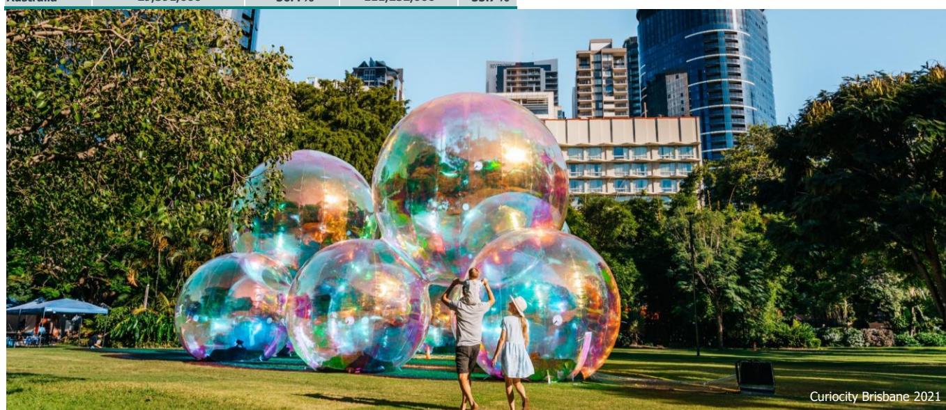
Curiosity Brisbane 2021

For tourism region definitions, please see https://www.tra.gov.au/Regional/tourism-regions .