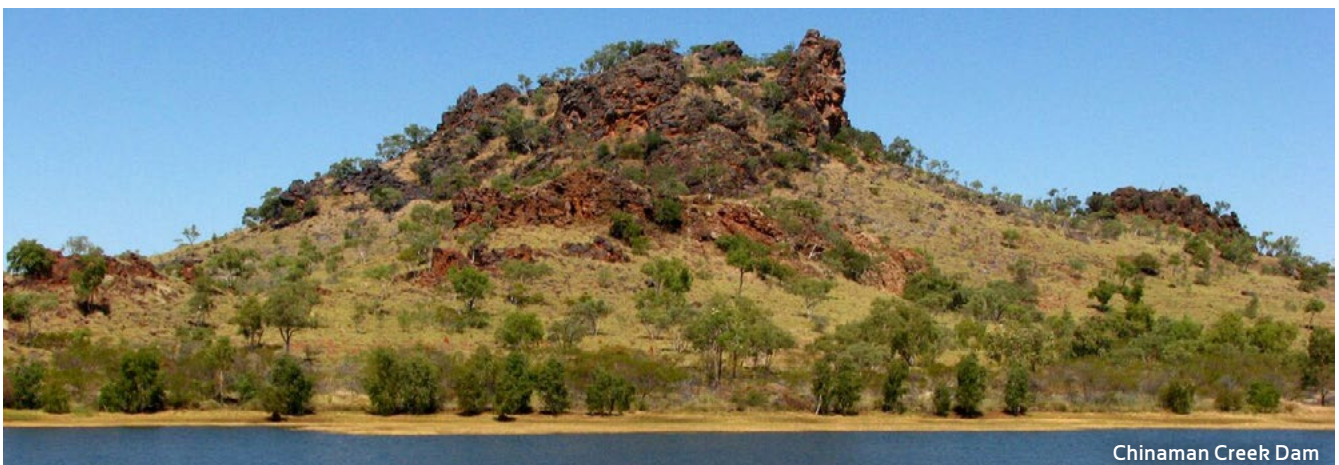
Chinaman Creek Dam

Accommodation: Discovery Parks, Cloncurry. Ph: (07) 4742 2300