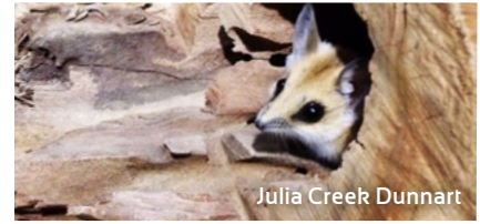
Julia Creek Dunnart

Highlights: Kronosaurus Korner Bush Tucker Garden at Lake Fred Tritton Julia Creek Orientation Activity Evening Star Gazing activities